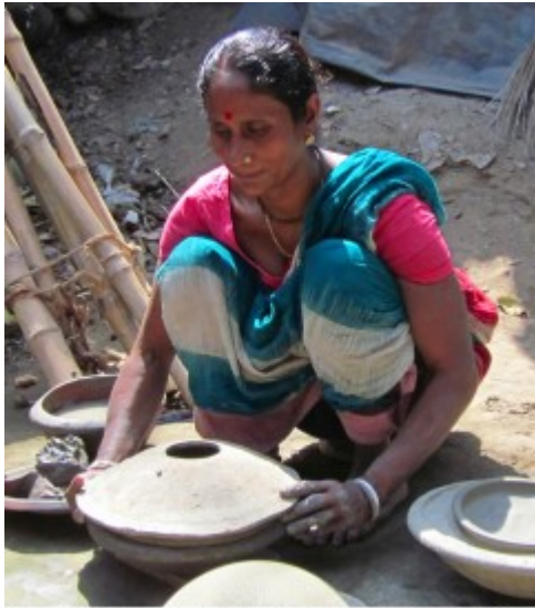
A woman in Bangladesh squats – a typical posture in this region of the world - while making pottery.

Are you (or perhaps a colleague) affiliated with an institution in an economically developing country (EDC) and interested in attending ISB2013? The ISB recently announced another initiative to support biomechanists in EDC regions to attend their biannual congress by means of the EDC Congress Travel Grant .